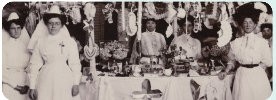
Silverchain nurses at one of our first WA fundraising fetes in the early 1900s.

Similarly, our heritage in South Australia, as the District Trained Nursing Society and then RDNS Silverchain, began in 1894 caring for vulnerable people.