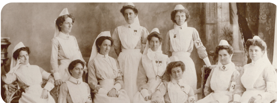
The District Trained Nursing Society began in South Australia in 1894.

Together, we can create a better home care system for all Australians, and shape the future of health and aged care.