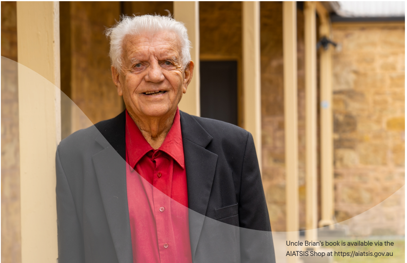
Uncle Brian's book is available via the AIATSIS Shop at https://aiatsis.gov.au